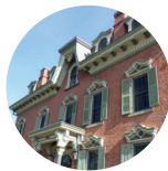
Franklin Public Library

Join us at Franklin & Oil City libraries this month for FREE science craft nights! Make a fun and unique sensory bottle AND receive a Self-Esteem Workbook – all free of charge! A sensory bottle is a bottle filled with different materials generating a variety of sensations and stimulating essential areas of the brain when it's moved. It's a great tool to foster curiosity & the desire to explore! All materials will be provided. This event is made possible & sponsored by Recovery is Community NWPA.